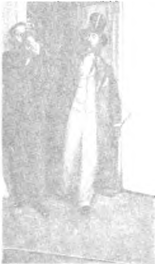
with the pistol late afternoon, 1911